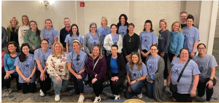
(Some of our) amazing Auction Committee